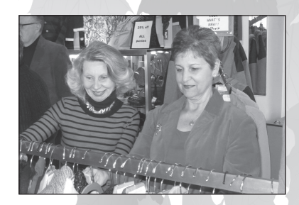
Shoppers at work!