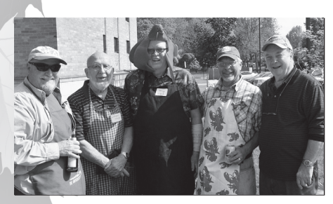
"The Lobstamen of 2015"

On Friday, May 15, 2015 the year-ending Lobster & Suds Party was again held at Zwisler Hall on the St. Sebastian Church Campus. The major topics of discussion among attendees were the "Ohio polytechnic university" tagline and the recently announced closing of West Point Market.