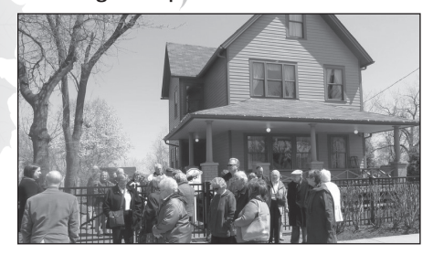
The house fron "A Christmas Story".

to the ceilings with over 3500 different candies. We shopped and many of us bought "hard to find" nostalgic candy. We thought all was well as our bus started to depart for home, when someone noticed that we were missing one person! Tom and