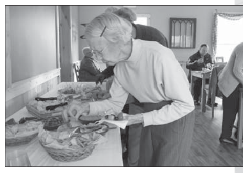
At the Ciuntry Porch Winery

If you have not taken part in one of our retirees annual Road Trips, you are missing out on learning about the interesting history of people and places located very close by. Next April please plan to join us for another enjoyable, well-planned day trip. All you have to do is "get on the bus"!