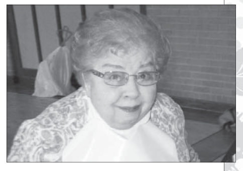
Umm Umm, Good!