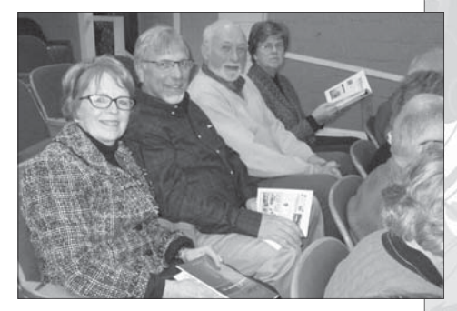
Ready for Act I

cabin and her husband is wounded while arguing with his former fiancée in the ship's lounge. So who killed the young bride and why?